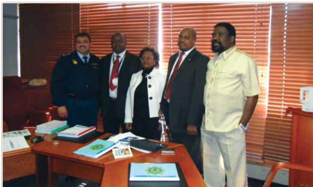
CIC Commissioners with Senior Police Officers of the South African Police Service