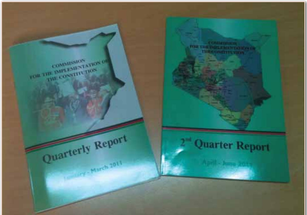
Copies of the quarterly report