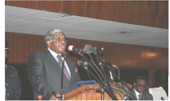
President Mwanawasa addressing NCC members during the official opening of the Conference On December 19, 2007.

The sittings commenced on Wednesday, December 19, 2007 at 08:30 hours.