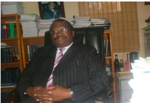
Hon. Chifumu Banda, NCC Chairperson

All these proceedings leading to the elections were convened by Justice Minister Hon. George Kunda who later handed over the instruments of power to the Chairperson Hon. Chifumu Banda